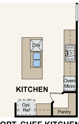
OPT. CHEF KITCHEN