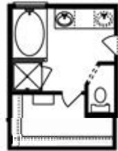
STANDARD MASTER BATH